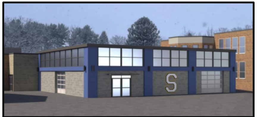
A sample depiction of the proposed Sherman Central Agriculture and Technology Improvements.

For more information go to www.minervalibrary.org and www.shermancsd.org