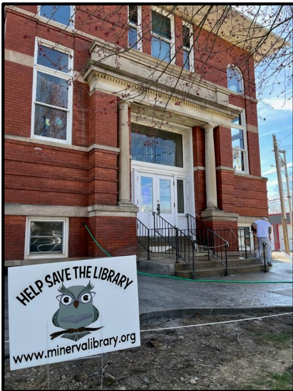
The Minerva Free Library learning center patio improvement provided by the NYS Construction Grant.

We encourage you in the weeks ahead to be supportive of the missions of our organizations directly Serving Our Great Community!