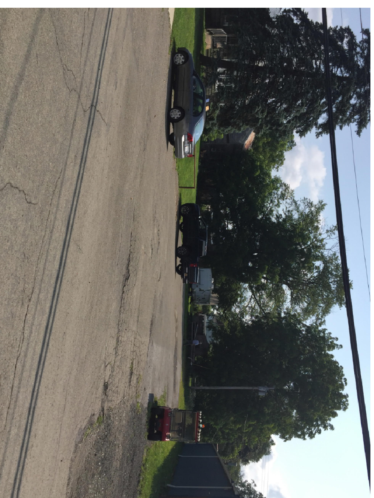
EXISTING SITE PHOTO OF 104 CHURCH STREET